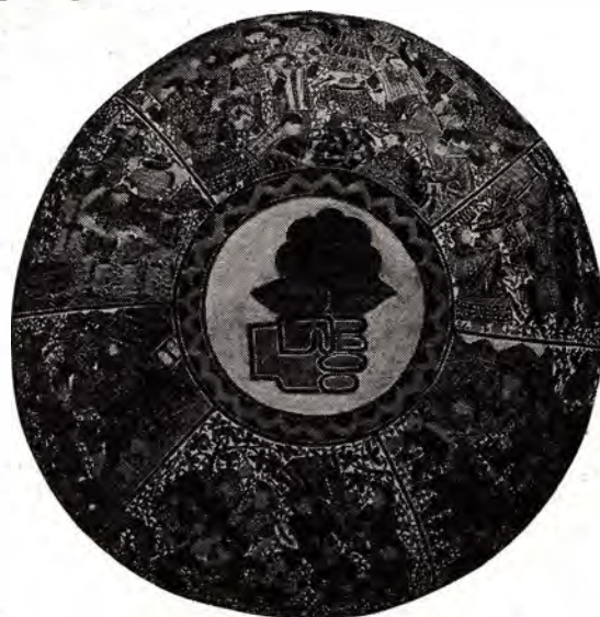
The bowl pictured above, part of the image used on the official poster of the Lima Congress, was made by Peruvian craftspeople.

And in facing up to the new challenges, many at the Lima Congress evoked the memory of Olof Palme, the late leader of the Swedish Social Democrats. Anita Gradin, head of the Swedish delegation, spoke for many when she said that 'Olof Palme was a man who had the courage to be in the forefront of many international battles; his work for peace and security, for freedom and justice, inspired many of us.'