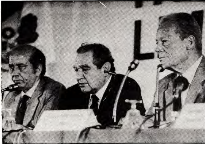
Carlos Andrés Pérez, Armando Villanueva, Willy Brandt

updated version of the first report adopted at the 1980 Madrid congress. It is also an attempt to take a fresh look at, for instance, the need to prevent the militarisation of outer space.