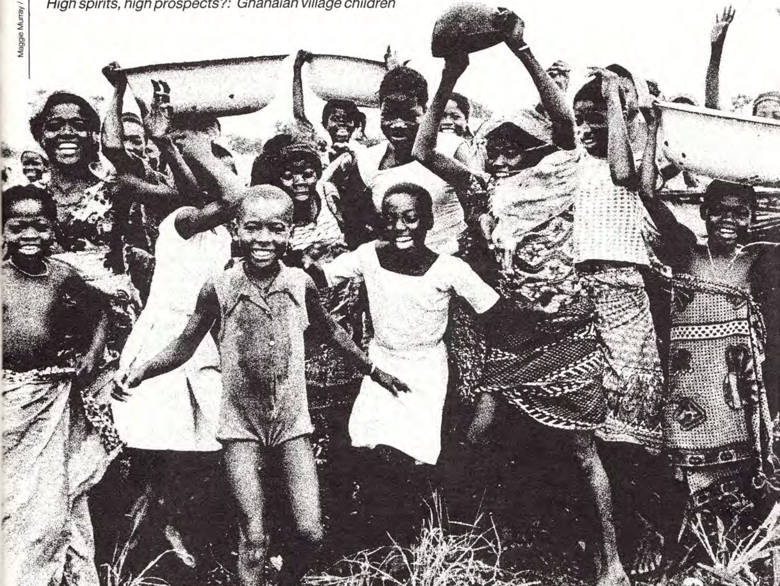
High spirits, high prospects?: Ghanaian village children

- Ninthly, it reminds us that this additional spending of $100