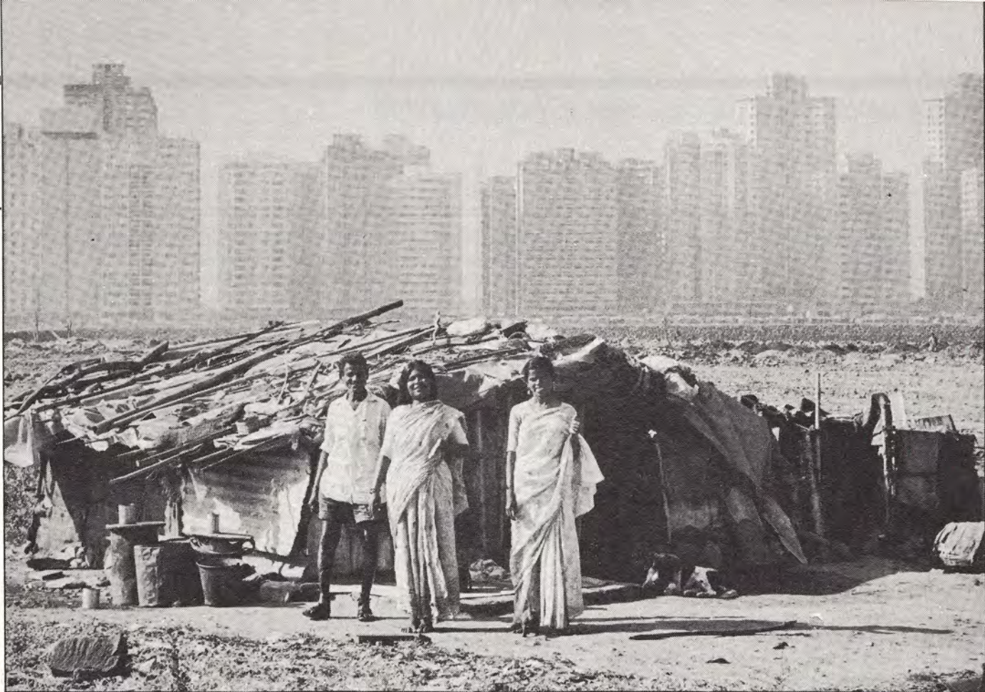
Wealth gap: Construction workers on a housing and office-building site, in Bombay, India

exports and limit imports, and government spending cuts at a time of grievous human suffering. In effect, the masses of the Third World, and of Latin America especially, had to pay with their living standards for debts which had often been undertaken by anti-democratic regimes and had, in any case, been artificially and unfairly increased by the anti-inflation policies of western conservatives.