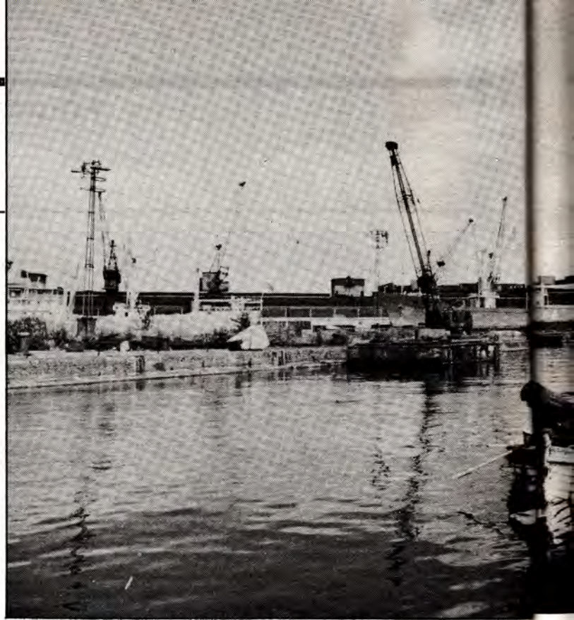
Industry adrift: Unemployed fishing for eels in London docklands

T he fate of our globe may well depend on whether a new mode of coexistence can be achieved between the two nuclear superpowers, something of which recently one could