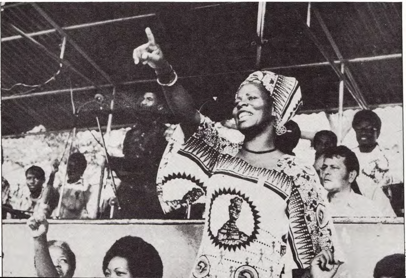
Making a point for freedom: SWAPO activist addressing a rally in Angola

(80) On the occasion of the tenth anniversary of the Soweto uprising in 1976 the South African regime stepped up repression and violence by declaring a state of emergency. Each day non-white children are being killed by state terrorism. South Africa continues to destabilise and attack neighbouring states. The world at large has a responsibility to stop this outrageous system. (81) International sanctions might be the last chance for peaceful change. The opposition in South Africa supports them. Therefore, the SI calls for: – halting investments in South Africa and ending government